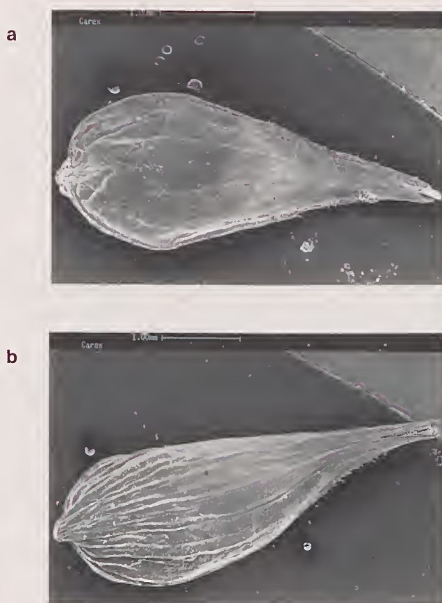
Fig. 2. Utricle of Carex klaphakei : a, adaxial surface; b, abaxial surface.

Conservation status: 3K; the species is not known from any national parks or reserves, but it is a very slender species and could well be overlooked because it grows mixed with other sedges and rushes such as Empodisma minus in swamps.